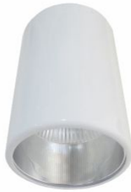
SK - 3400