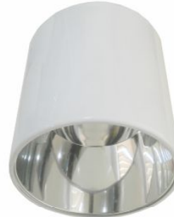
SK - 3800