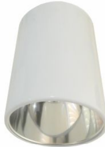
SK - 3700