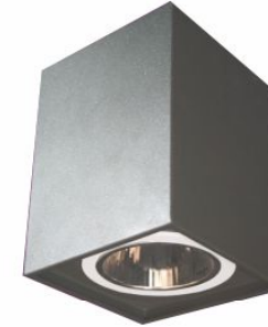
SQR - SK - 401