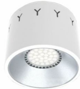
OS 165/S (PL-CN111)