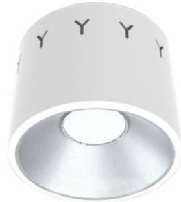
OS 164/S (PL-CUBE)