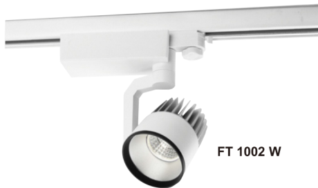
FT 1002 W