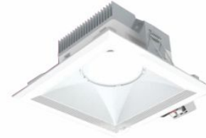
Square OS 4/S & OS 6/S