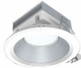
Round OS 4/R & OS 6/R