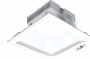
Square OS 4/S - D & OS 6/S - D