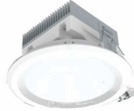
Round OS 4/R -D & OS 6/R - D