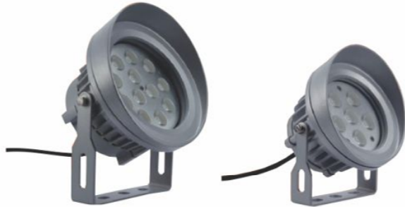
OLUX LED SPOT M